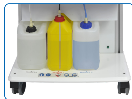
SERIE 3 PA version