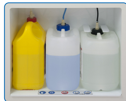
SERIE ENT / SERIE TEE